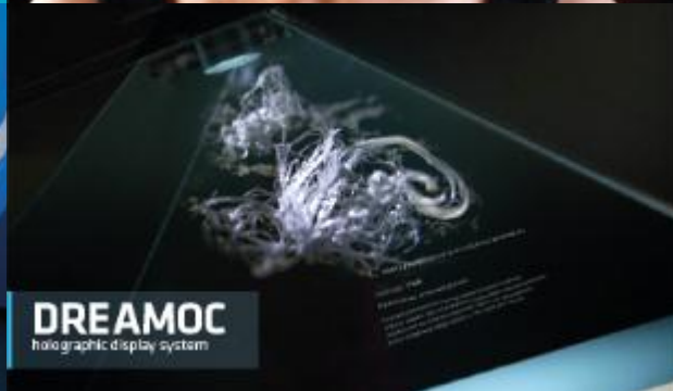
DREAMOC holographic display system