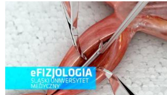
eFIZJOLOGIA ŚLĄSKI UNIWERSYTET MEDYCZNY