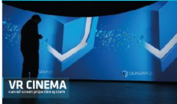
VR CINEMA curved screen projection system