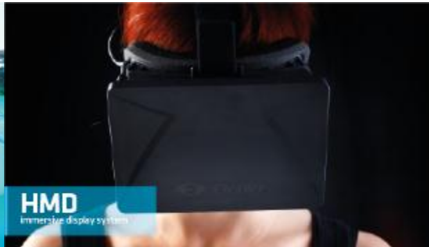
HMD immersive display system