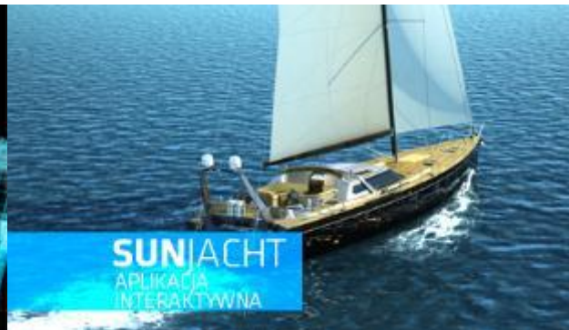
SUNJACHT APLIKACJA INTERAKTYWNA