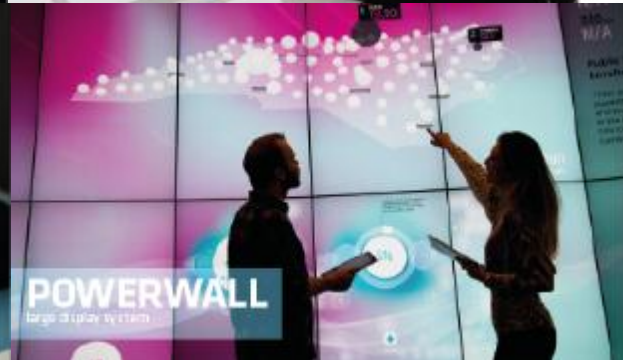
POWERWALL large display system