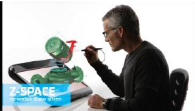
Z-SPACE holographic display system